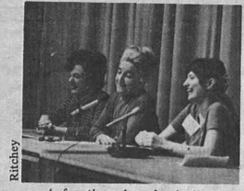
"...for the sake of winning and the sake of the electorate"

Although Virginia women have been voting for 51 years, we have not yet elected a woman to Congress. Furthermore, out of the 150 members of the Virginia Assembly, only one is a woman. Women make up more than 50% of Virginia's population, yet at the 1968 national conventions, only 13% of the Democratic delegates and 17% of the Republican delegates were women.